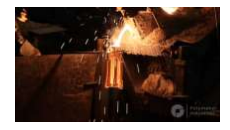
Figure 10. Pour the molten stainless steel into the shell

You can contact 3DHubs (<a href="https://www.3dhubs.com">https://www.3dhubs.com</a>) if you need such service.