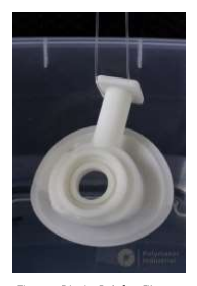
Figure 4. Dip the PolyCast™ SP802C pattern into isopropyl alcohol

STEP5: Allow the part to rest in a vacuum(preferred) or convection oven at 40 °C for 1 hour to ensure complete solvent evaporation and surface hardening.