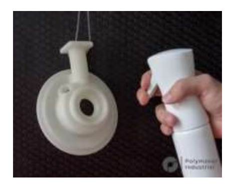
Figure 5. Spray isopropyl alcohol on the PolyCast™ SP802C pattern