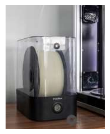
Figure 2. PolyBox™ - the perfect solution for storing 3D printing filaments

PolyCast™ SP802C is compatible with Polymaker's Micro-Droplet Polishing™ technology, which is the recommended technology for post-processing 3D printed patterns. The technology works by exposing the printed model to a dense mist of tiny (< 10 µm) alcohol droplets, which are absorbed locally onto the surfaces of the printed model and subsequently make them smooth (with layer lines no longer visible), while preserving macroscopic dimensional accuracy. The process can be done seamlessly using Polymaker's desktop machine, the Polysher™ (purchased separately).